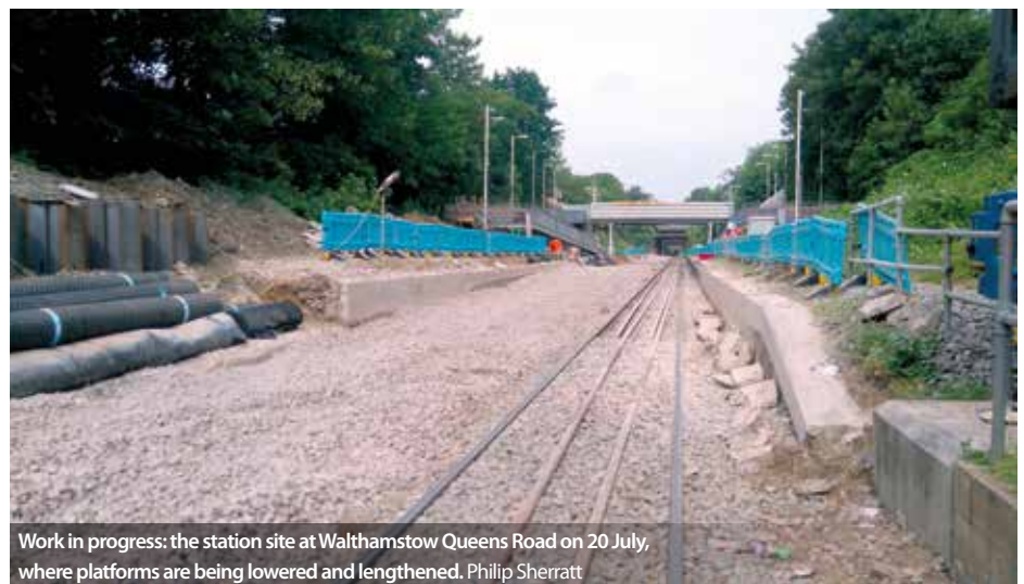
Work in progress: the station site at Walthamstow Queens Road on 20 July, where platforms are being lowered and lengthened. Philip Sherratt

Blockade: track lowering works on the up line between Blackhorse Road and Walthamstow Queens Road on 20 July. The barriers in the foreground mark the point where there will be a switch from slab track (nearer the camera) to ballasted. Philip Sherratt