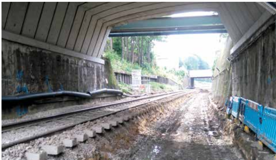
Track lowering: in this view of 20 July the up line beneath Albert Road bridge (just south of Walthamstow Queens Road station) has been dug out and awaits the pouring of ballast. The tracks here are being lowered by 500mm. Philip Sherratt

Early plans for electrification envisaged 10 track lowering sites along the route, but value engineering has seen this reduced to four main sites. The first, a 200-metre section between Upper Holloway and Crouch Hill, was completed during a series of weekend closures in April and May, before the main blockade began. A 320-metre section which includes Crouch Hill tunnel (between Crouch Hill and Haringey Green Lanes) and a 160-metre stretch between Gospel Oak and Upper Holloway will be dealt with when the whole line blockade begins in September. There is also a 150-metre section of