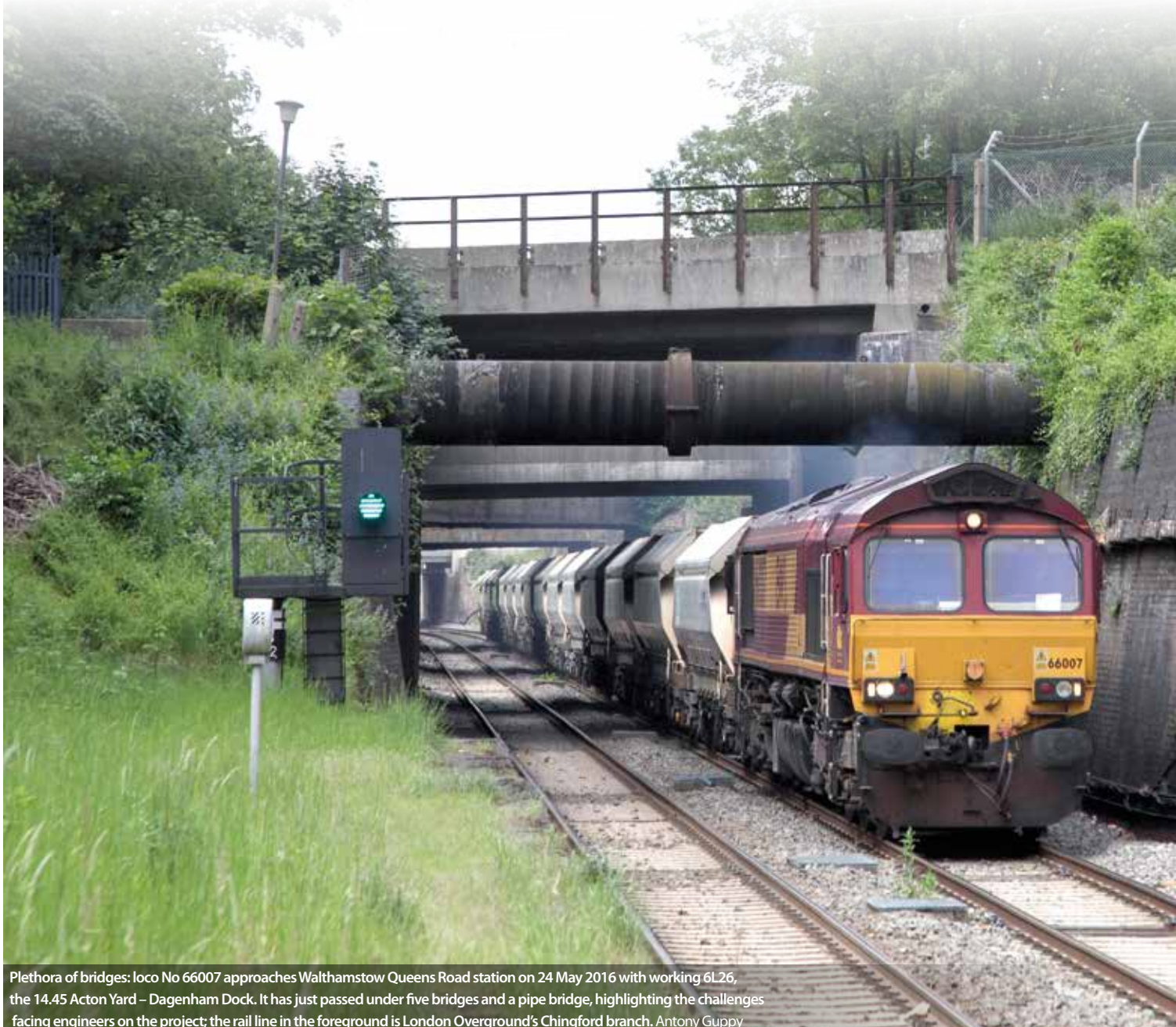
Plethora of bridges: loco No 66007 approaches Walthamstow Queens Road station on 24 May 2016 with working 6L26, the 14.45 Acton Yard – Dagenham Dock. It has just passed under five bridges and a pipe bridge, highlighting the challenges facing engineers on the project; the rail line in the foreground is London Overground's Chingford branch. Antony Guppy

The original plan for the GOBLIN was to carry out works at weekends over a two-year