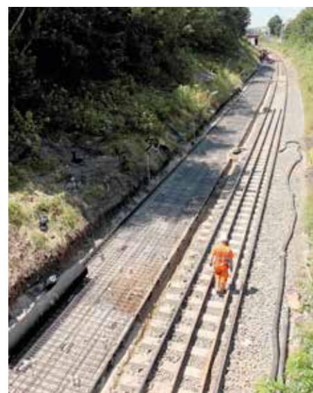
Slab track installation: work in progress on the up line near Blackhorse Road on 18 July. Antony Guppy

But the most challenging section, and the one which drives the requirement for engineering