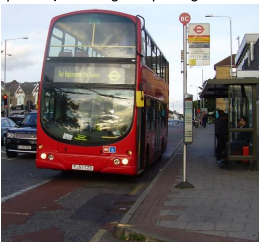
Contractor number three takes over Route T

With LO rail replacement buses now on i-bus and countdown , the Gospel Oak – South Tottenham bus service is now christened Route 'J'. Route 'T' (Barking – South Tottenham) passed to the third contractor this year on 13 th September and we hope that their drivers will have learnt the route by now! BGORUG members having to assist drivers and navigators with directions on their first day! There were a couple of hour long gaps in service too. It was a shock to find a LOROL Customer Services Assistant at Barking! She was doing a splendid job dealing with passengers, considering she had no information on where the buses were!