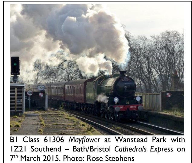
B1 Class 61306 Mayflower at Wanstead Park with 1Z21 Southend – Bath/Bristol Cathedrals Express on 7 th March 2015.

The return train 1Z84, is booked at Finsbury Park at 19:07-19:09 and Camden Road at 19:19. Full details available from www.steamdreams.com or www.CathedralsExpress.co.uk . Do not forget that in the event of Mayflower failing her fitness to run examination on Saturday, another steam loco or a diesel locomotive will be substituted.