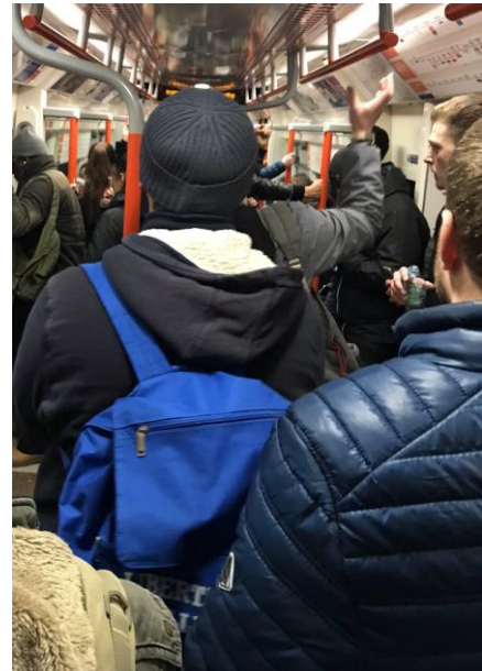
06:48 ex Barking after Leytonstone High Road on 14 th February

BGORUG will also do its best to advise passengers of the appeals service provided by London TravelWatch should their refund applications be rejected by TfL.