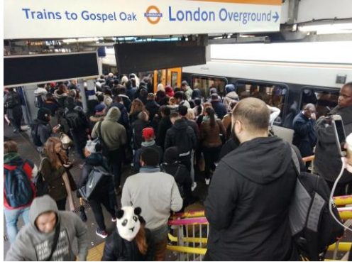
Photography © BGORUG Any reuse must be credited Enquiries to BGORUG