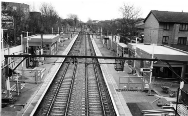
Woodgrange Park station was electrified in 1962. TfL are funding new ticket gates and the new buildings for the gates are seen here. Wanstead Park will also have ticket gates installed.

Most stations have had their platforms extended for 4-car trains and received new passenger shelters and canopies. Blackhorse Road will have the lifts to the platforms finished by April.