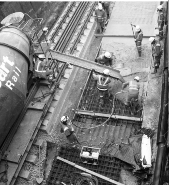
Pouring concrete slab track under Queen’s Rd bridge, Walthamstow