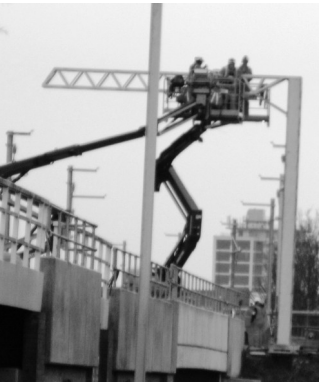
Engineers working on a mast by the River Lea bridge.

Wightman Road bridge in Harringay was rebuilt to provide clearances and life expired bridges were also renewed at the Lea Navigation and Holloway Road, the latter designed to provide clearance for wires.