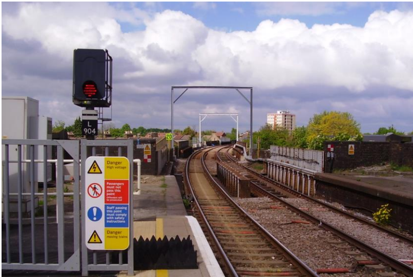
20mph Temporary Speed Restriction at the London end of Wanstead Park, note the way-beam bridges which still remain in this area. [26.04.2017]

"Network Rail's resources during the summer are now committed to Crossrail, Waterloo and London Bridge,"