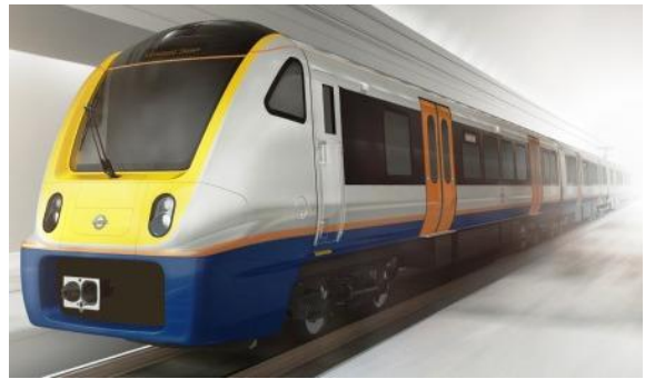
Artist's impression of the new Class 710 Aventura trains being built by Bombardier at Derby.

The first 14 of the new trains (Class 710/2) were due to be shared between the Barking – Gospel Oak and Euston – Watford Junction services, the remainder (Class 710/1) going to Romford – Upminster and Liverpool Street – Cheshunt/Chingford/Enfield Town services.