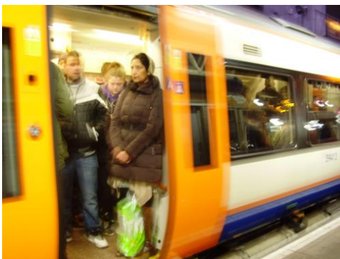
The doors close on a full and standing 07:33 Barking to Gospel Oak at the start of its journey on 6 th January 2015

“When the new electric Aventra trains do arrive BGORUG will be pressing TfL to implement the options in the contract with Bombardier to provide enough trains to operate the new extension to Barking Riverside and the rest of the line with a train every 12 minutes in peak times with off peak services never being less than every 15 minutes.”