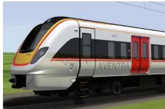
The new Bombardier Aventra train which will be built in Derby and delivered to Crossrail in 2017 and London Overground in 2018